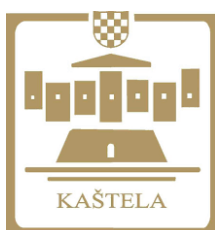
CITY OF KAŠTELA, CROATIA Lead partner

The project partnership is formed according to the principles of added value of each individual partner to project activities and final results. The intention is to include stakeholders in the field of archive and development, SMEs, NGOs, enterprises, regional public authority, local public authorities, sectorial agencies and others combining all three project partners: