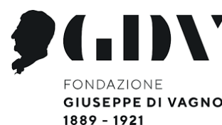
GIUSEPPE DI VAGNO FOUNDATION, ITALY

Also, the goal was to include project partners in the mentioned program area. The partners were carefully selected to contribute to the development of the project idea with their added value. Also, in order to exchange different and valuable experiences of approaching the project topic in different contexts.